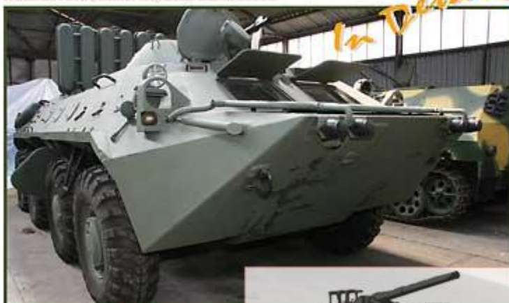
Illustration of BTR-70, Soviet Armored Vehicle in the Russian Army Collection

Soviet Modern Armoured Wheeled Vehicle BTR-70 in the Russian Royal Army Museum Collection