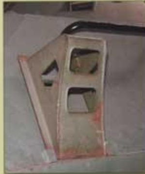
010 Hull Sides