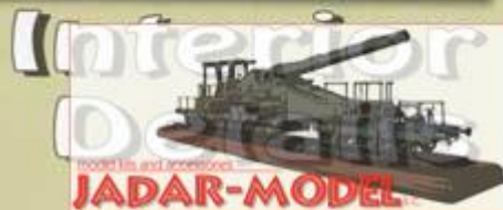
028 Interior Details

In the front hull under the turret there are seats for all four crewmembers including the driver and commander. The backrests of the front (driver's and commander's) seats can be folded down if necessary.