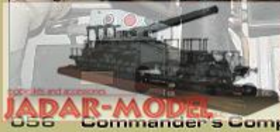
JADAR-MODEL 056 Commander's Compartment Details