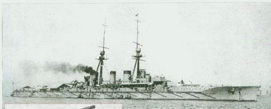
A very clear almost 100% view of BC Kongō as she appeared in 1914. She is anchored in Yokosuka naval port with #2 main gun turret turned to port and #3 turret turned to starboard. Her paint has changed from the dark grey to a very light one, but the main mast and support struts of the tripod masts are still dark. When Japan declared war upon Germany on 23 Aug 1914, she was the flagship of 1F 3S (First Fleet (Kantai), Third (Division) Sentai).