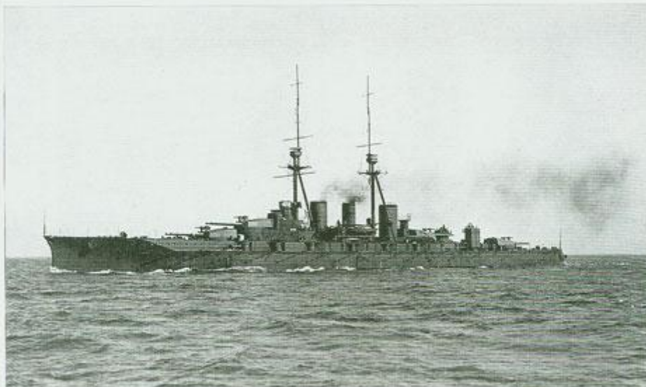
This photo may have been taken when BC Kongō navigated from the builder's yard to Belfast to enter the great dock there for cleaning and painting her bottom in preparation of the trials. The high rectangular-shaped container on both sides between #3 and #4 main gun turrets were used for metering the circulation of the boiler water and the supply of good quality pure water and mounted, of course, only for trials. This method was taken up by the IJN and applied until the trials of Ise and Hyūga .