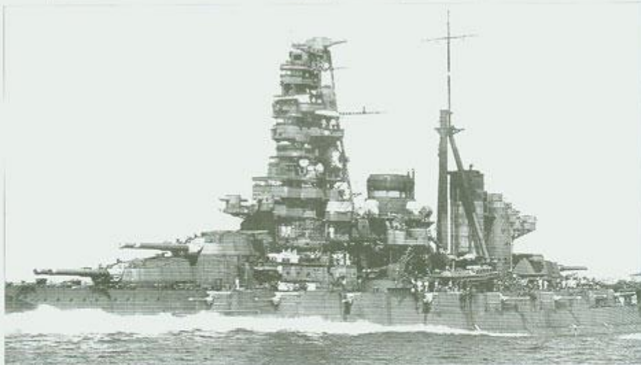
Midship of BC Haruna in 1928 (upper) after the first modernisation conversion and 1934 after the second one. Pay attention to the reversion of the height of the funnels beside of noting the complete revisions of foremast and after superstructure.

NOTE: BB Haruna was the only one of Kongō class that 'survived' the war but sitting at the bottom of sea near to Kure after the heavy carrier-based B-29 attacks in Jul 1945. Readers interested in this ship can find a series of full page photos showing her condition when inspected by British navy personnel and under air attack in Vol. 1 of World War II magazine.