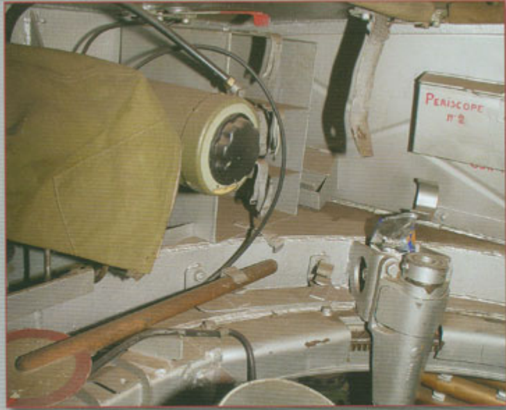
Turret Interior - Rear 047

In the turret rear part is the place for communication/wireless equipment. Because this radio is the same as that in the Fox presented in this book, details are shown in the Fox Turret Details chapter in the second half of this publication.