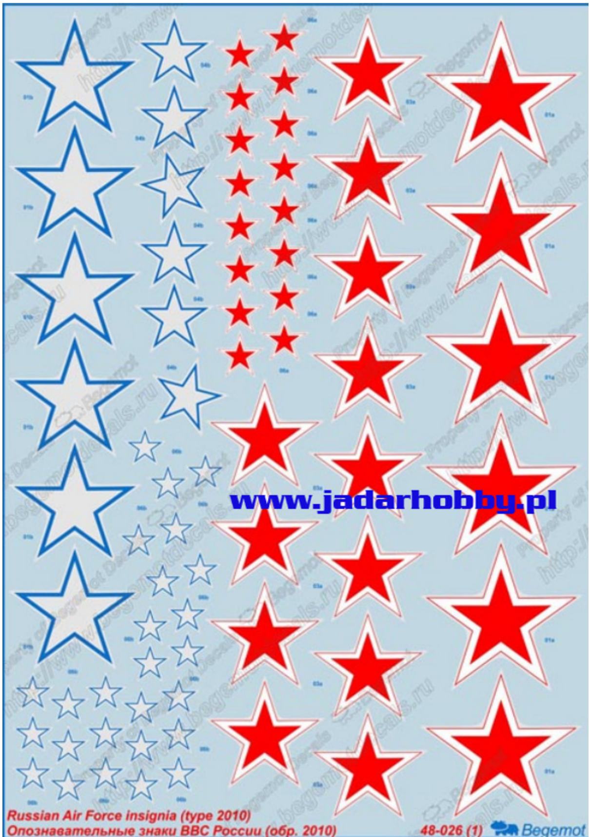
Russian Air Force insignia (type 2010) Опознавательные знаки ВВС России (обр. 2010)