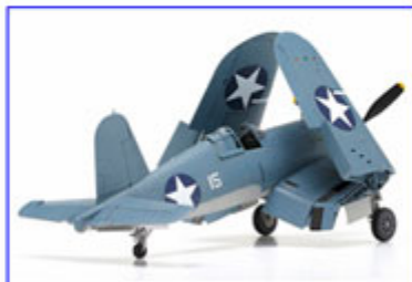
■ 3-piece flaps and elevators can be recreated in up or down positions.