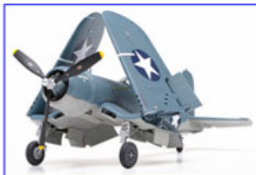
■ Inverted gull wing can be constructed in folded or extended position as the modeler desires.