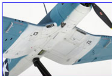
■ This picture of the underside of a model Corsair in flight shows an example with bomb racks attached.