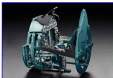
■ Clear parts recreate the window in the bottom of the floorless cockpit, and are also used on instrumentation panel, lights and more.