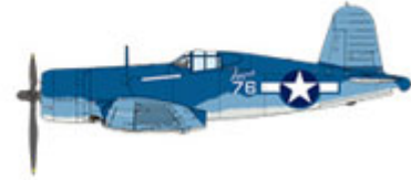
U.S. Marine Corps VMF-215, Munda, Solomon Islands, 1943