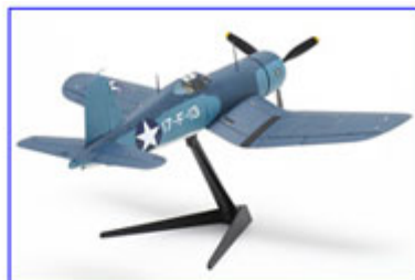
■ Main landing gears and tail wheel can be assembled in deployed or retracted positions. A stand is included to depict the plane in flight.