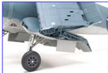
■ Model even features precise detail on the inside of the wing fold joint. Synthetic rubber tires feature realistic tread patterns.