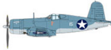
U.S. Marine Corps VMF-213, Munda, Solomon Islands, 1943