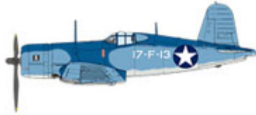
U.S. Navy VF-17, USS Bunker Hill, 1943

■ Tail wheel can be assembled in retracted or deployed position. Details such as the interior bulkheads have been accurately reproduced. (Cross-section model in image is for demonstration purposes only.)