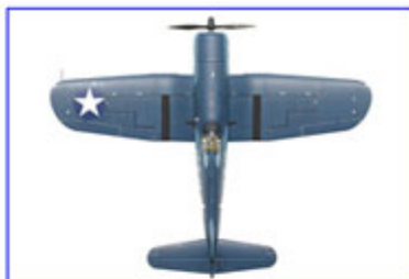
■ 1/32 scale enables even more precisely-molded parts.