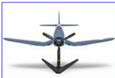
■ Instantly-recognizable inverted gull-wing features excellent attention to detail.