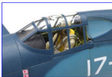
■ Choose open or closed "Birdcage" canopy, with separate parts to create open or closed rear window.