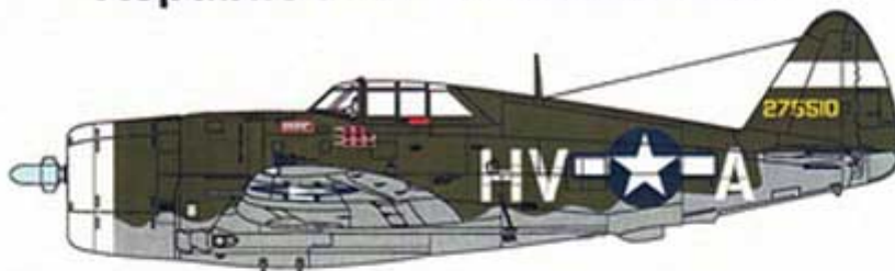
P-47D-11, HV-A 42-75510, Lt Col. Francis Gabreski, 61st FS, 56 FG, 8 AF, Halesworth, January 1944. P-47D-11, HV-A 42-75510, ppłk. Francis Gabreski, 61 FS, 56 FG, 8 AF, Halesworth, styczeń 1944.