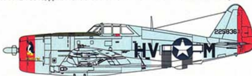
P-47D-22, HV-M 42-25836, Cpt Mike Gładych, 61st FS, 56 FG, 8 AF, Boxted, July 1944. P-47D-122, HV-M 42-25836, kpt. Bolesław Gładych, 61 FS, 56 FG, 8 AF, Boxted, lipiec 1944.