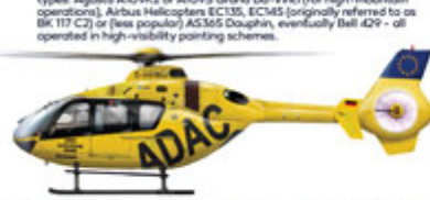
Eurocopter EC-135P2+, c/n 0875, D-HGWD, "Christoph Leisig", ADAC, 2010