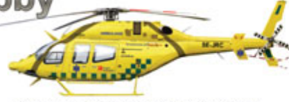
Bell 429 GlobalRanger, c/n 57154, SE-JRC, Scandinavian MediCopter, Vabø Airport, 2014