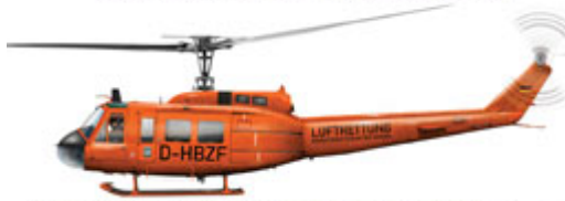
Bell UH-1D Huey, c/n 8326, D-HBZF, BGS Fliegergruppe, BMI Luftrettung, 1997

Standard colours of modern European air ambulance helicopters