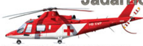
Agusta A109K2, c/n 10027, HB-XWR, Schweiz Luftambulanz AG (REGA), 2002