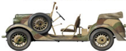
Front: Vickers E. Back: Ursus A TKS tankette transporter, Fiat 508 III W "Lazik"

Standard colours of Polish vehicles in 1939