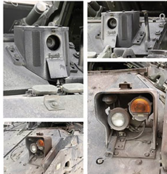
NOTE 16 MODEL LEFT: Cannon Identification Panel, snapped to the side of the left side of the turret.