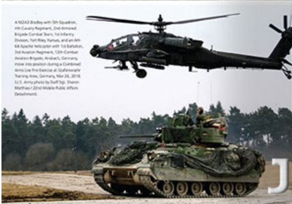
A M1A2 Bradley with 5th Squadron, 4th Cavalry Regiment, 2nd Armored Brigade Combat Team, 1st Infantry Division, Fort Riley, Kansas, and an AH-64 Apache helicopter with 1st Battalion, 3rd Aviation Regiment, 12th Combat Aviation Brigade, Fort Bragg, during a combined arms live fire exercise at Grafenwöhr Training Area, Germany, Mar 24, 2018.