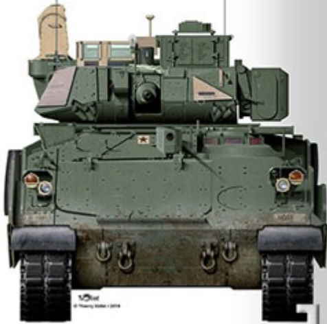
M2A3 Bradley 5th Squadron, 8th Cavalry Regiment, 2nd Armored Brigade Combat Team, 1st Infantry Division, vehicle HQ26