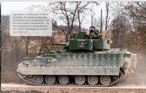
Big red dots (in weathering on the top of the Bradley). The vehicle is painted green, but the base coat is covered with enough dirt that it appears to be painted tan. The main mounting doors are tan along the hull, and the door appears to sit up on the back of the turret.