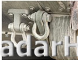
BELOW: Two shackles on the lower front of the Bradley. A set is on the left and the right.