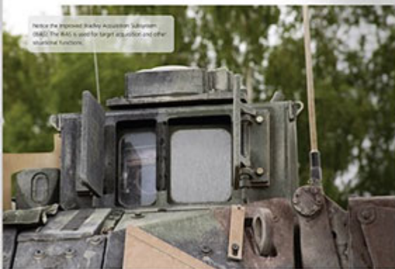
Notice the Improved Bradley Acquisition System (IBAS) processor cover for target acquisition and other essential functions.