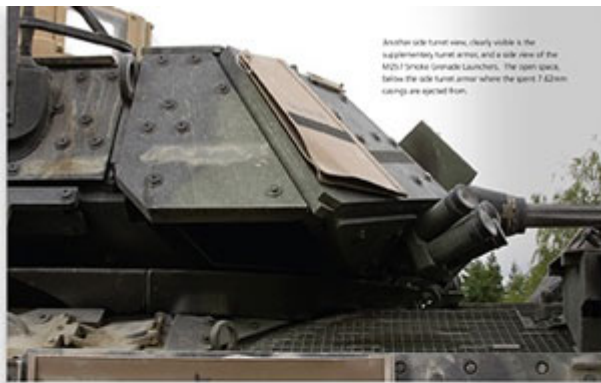
Another side turret view, clearly visible is the supplementary turret armor, and a side view of the M207 Smoke Grenade Launchers. The open space, below the side turret armor where the spare 7.62mm stumps are stored from.