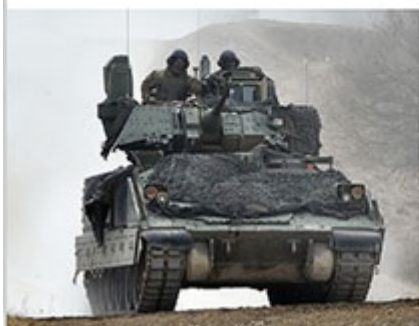
PAGE 33-35: A M1A2 Bradley with 5-4 Cavalry, 1st Infantry Division and an AH-64 Apache Longbow helicopter Task Force 1st Battalion, 3rd Aviation Regiment, 12th Combat Aviation Brigade are in firing position for a combined arms live fire exercise at the 7th Army Training Command's Grafenwöhr Training Area, Germany, March 24, 2018.