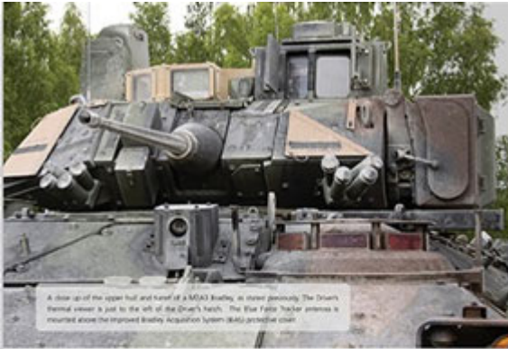
A close-up of the upper hull and turret of a M2A3 Bradley, as shown previously. The turret thermal viewer is just to the left of the driver's hatch. The Star Filler "hockey puck" antenna is mounted above the Improved Bradley Acquisition System (IBAS) processor cover.