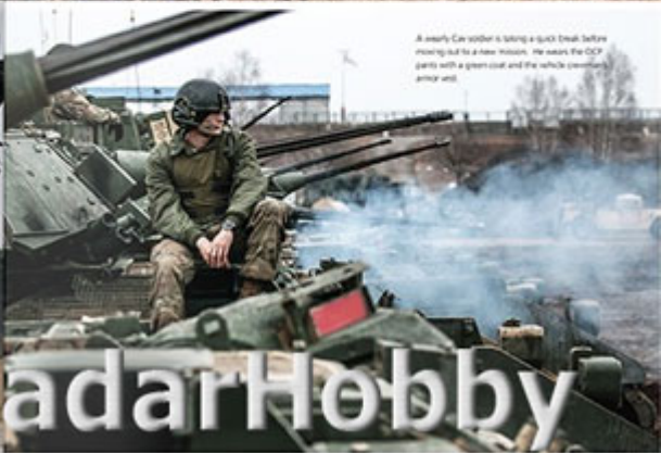
A nearby Cav soldier is taking a quick break before moving out to a new mission. He wears the OCP pants with a green coat and the vehicle personnel group and.