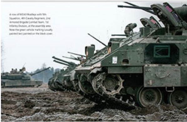
A row of M1A2 Bradleys with 5th Squadron, 4th Cavalry Regiment, 2nd Armored Brigade Combat Team, 1st Infantry Division, at the assembly area. Note the green-vehicle markings usually painted by personnel on the back cover.