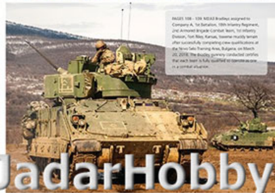
NOTE 108 - 120: M113 Bradleys assigned to Company A, 1st Battalion, 18th Infantry Regiment, 3rd Armored Brigade Combat Team, 1st Infantry Division, Fort Riley, Kansas, receive mobility training after successfully completing crew qualifications at the Fort Sill Training Area, Bulgaria, on March 20, 2018. The mobility journey conducted earlier that each team is fully qualified to operate in a combat situation.