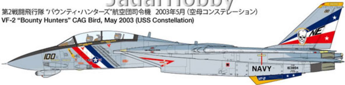
第2戦闘飛行隊 "バウンティ・ハンターズ"航空団司令機 2003年5月 (空母コンステレーション) VF-2 "Bounty Hunters" CAG Bird, May 2003 (USS Constellation)