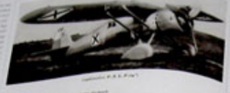
1. The aircraft was damaged during the attack on the airfield at Kaniemi, New Guinea, on 14 October 1944.

The aircraft was damaged during the attack on the airfield at Kaniemi, New Guinea, on 14 October 1944. The aircraft was damaged during the attack on the airfield at Kaniemi, New Guinea, on 14 October 1944. The aircraft was damaged during the attack on the airfield at Kaniemi, New Guinea, on 14 October 1944.