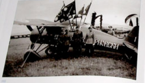
2. The aircraft was damaged during the attack on the airfield at Kaniemi, New Guinea, on 14 October 1944.

In 1944, a total of 112 B-24s were assigned to the 97 Bombardment Group, 8th Air Force, based at Kaniemi, New Guinea. The aircraft were assigned to the 97 Bombardment Group, 8th Air Force, based at Kaniemi, New Guinea. The aircraft were assigned to the 97 Bombardment Group, 8th Air Force, based at Kaniemi, New Guinea.