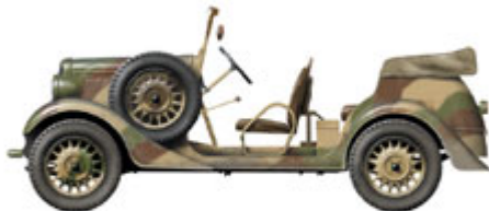
Front: Vickers E. Back: Ursus A TKS tankette transporter, Fiat 508 III W "Lazik"

Standard colours of Polish vehicles in 1939