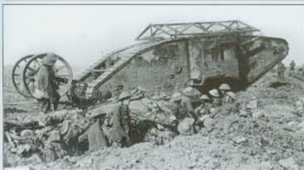
C15 a few days later, caked in mud. (TM 697/113)