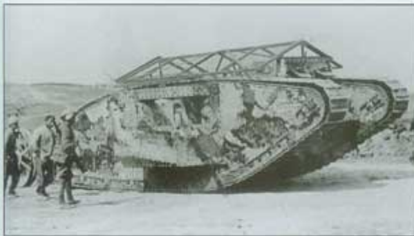
A clean C19 CLAN LESLIE in Chimpanzee Valley in September 1916. (TM 54/8/1)