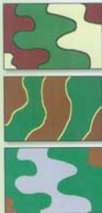
Example camouflage patterns as used on Artillery.