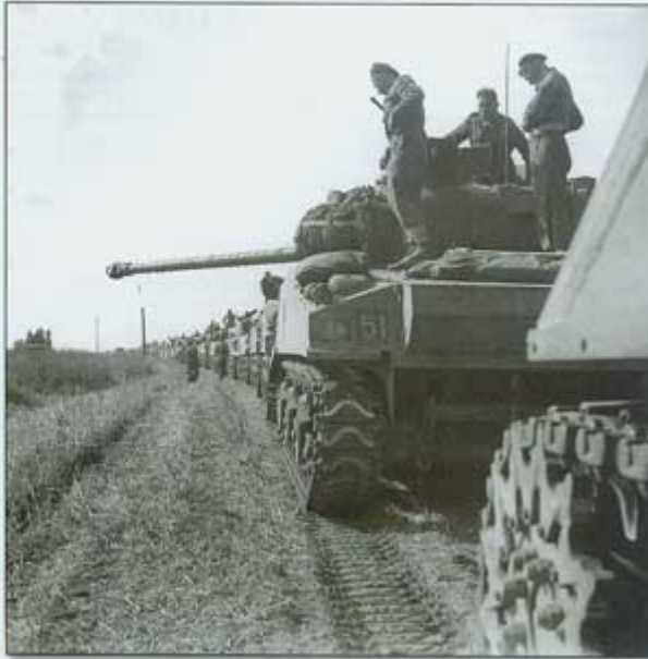
Polish Sherman Firefly in August 1944 carrying the national indicator PL.

later the Australians adopted their own independent numbering system. The style of the plate was officially meant to be a Red 'C' with Black numbers on a White rectangular plate, but, as always, there were frequently exceptions.