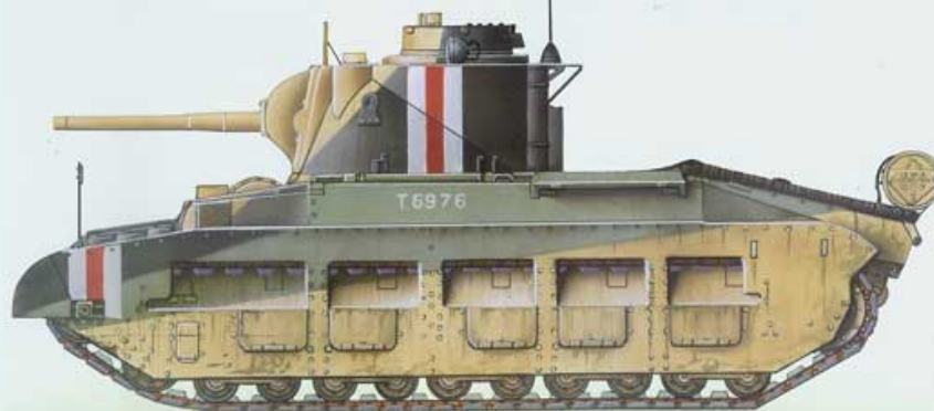
6976 was a Matilda II made by London Midland and Scottish. It is shown here in the Counter scheme used between late 1940 and late 1941 (see Volume 2) with the White Red White recognition markings adopted for Operation Crusader in November 1941 (See Volume 4)